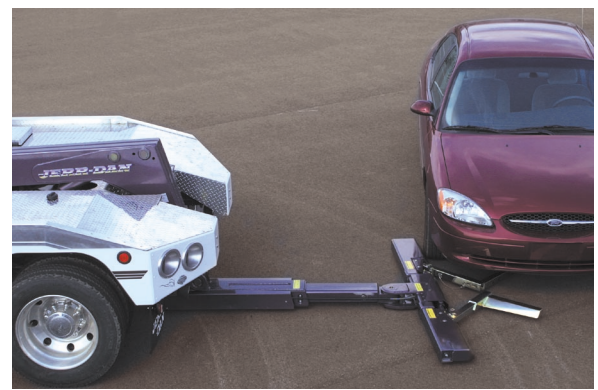
With the stinger extended and L-arms opened and adjusted for tire size the operator properly positions the wrecker