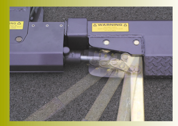
Adjustable L-Arm LOCKLINK - As the adjustable L-Arm closes, the LOCKLINK attaching the L-arm cylinder to the L-Arm rotates into an over-center position. The adjustable L-Arm is now locked in the closed position and cannot be forced open by a loss of hydraulic pressure.

Power Tilt Lifting Boom - The power tilt boom can also be tilted down to 10°. Not all QUICK-PICKS<sup>®</sup> occur on flat parking lot surfaces.